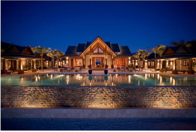
Architecture photography of the Nandana property at West End, Bahamas